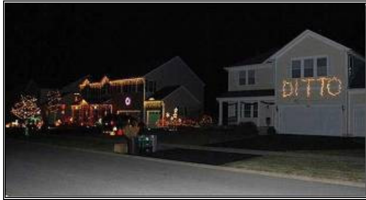
Christmas Spirit? Humbug!

With the Euro crisis staggering into the New Year – let's get some perspective: